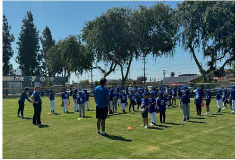
Players were treated to a free Dodgers Academy Clinic to hone their skills.