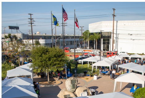
Guests enjoyed free food and giveaways, and a display of emergency vehicles.