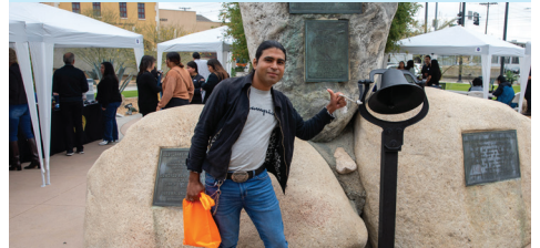
This job seeker was hired on the spot and rang the City's bell in celebration!