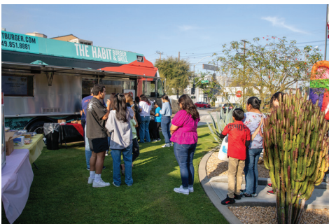
The Habit is always a hit, serving delicious burgers and fries to attendees.