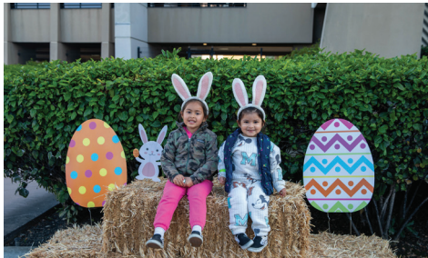
Little bunnies happily pose for a photo at the City's Spring Egg-Stravaganza.