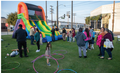
Excited kids get a helping hand from Bunny during the Easter Egg Hunt!