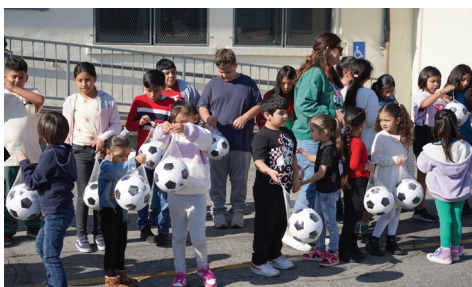
Vernon Elementary students collected their new soccer balls from Vernon PD.