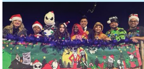
Festive participants joined Huntington Park for the annual Holiday Parade.