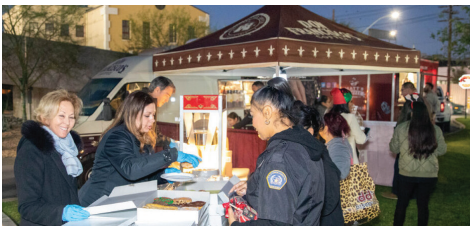
Tree Lighting guests enjoyed coffee, desserts, sledding, and a toy giveaway!