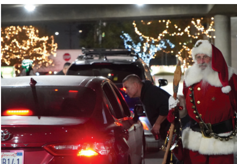
Santa and the Grinch surprised guests at the City's drive-thru gift giveaway event!