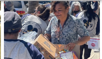
Donations are distributed by Helping Hands volunteers who make a difference in the community!