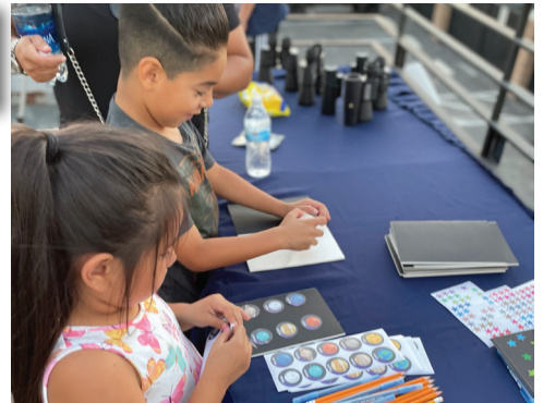
Kids enjoy the numerous educational crafts available during Stargazing Night!