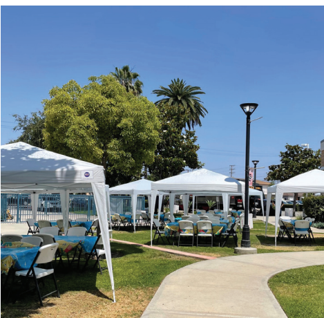
Shaded tables and chairs awaited guests ready to relax and enjoy their meals.