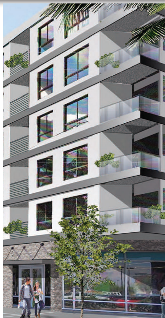
Rendering of a potential Santa Fe residential project.

The City Council recently adopted zoning changes for four districts in select areas along Santa Fe Ave. and Pacific Blvd. to encourage residential, live/work, standalone retail, and restaurant/entertainment uses, and to position the City to quintuple its population in the next few years. Multiple developers have expressed interest already. And, the City's first Starbucks is set to open within the next few months.