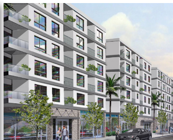
Rendering of proposed Santa Fe residential project

Vernon's 2021-2029 Draft Housing Element is now available for a seven-day public review at cityofvernon.org/housingelement . The City invites comments through email submission to dwall@cityofvernon.org . Following the public review period, the draft will be submitted to the State and, thereafter, to the Vernon City Council for consideration.