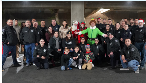
Santa and all of his City helpers gather for a photo during Operation Santa