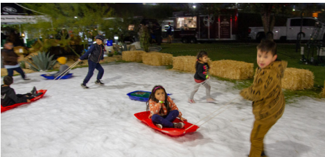
Kids enjoy the snowy City Hall Lawn during the City's Tree Lighting event