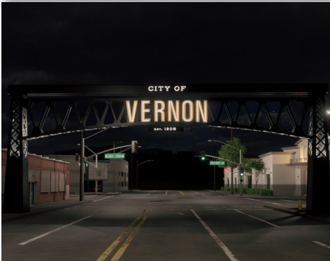
Vernon's Gateway Arch is being installed at the intersection of Santa Fe and 25th