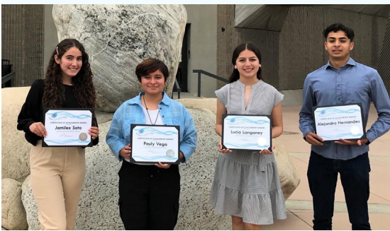
2022 VCF Scholarship Grantees accept certificates of recognition from City Council.

Vernon's CommUNITY Fund grants scholarships to high school seniors living in the Vernon area who are planning to pursue trade school, community college, or university after graduation. For 2023, $40,000 has been dedicated to the program! Applications will be accessible online beginning January 3, 2023, with a due date of March 30, 2023. Please visit www.vernoncommunityfund.org for more information.