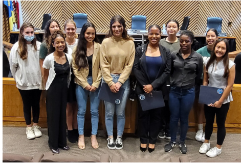
Students learned about public sector career path options from City staff.