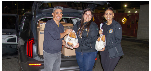
City Council joined in on the Fall Harvest meal distribution to the community.